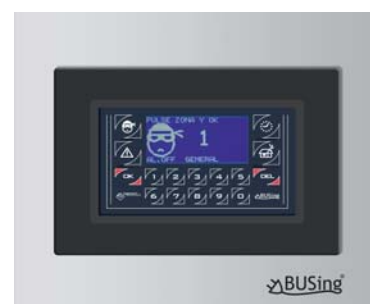
Real size: 15 x 10 cm

In real time communication with you, your house will be the one to alert you about any incident (flood, gas leak, burglary, etc.) automatically initiating the appropriate actions to minimize the problem (water or gas cutoff supply, trigger the alarm, etc.) and allowing you to enjoy this feeling of extra peace of mind, knowing that your house is protected 24 hours without interrupting your pace of life.