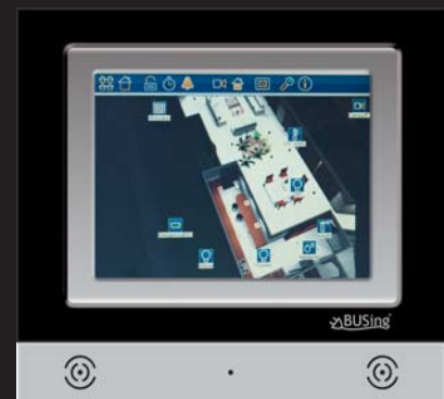
Real size: 33 x 30 cm

Design is the key to functionality; that's the prime value in which Ingenium designs its products, offering the widest range of possibilities with a contemporary image to make your smart home control system even more attractive.